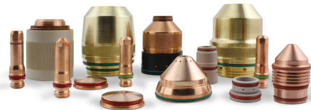
Hypertherm® & ESAB®