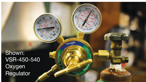
Shown: VSR-450-540 Oxygen Regulator