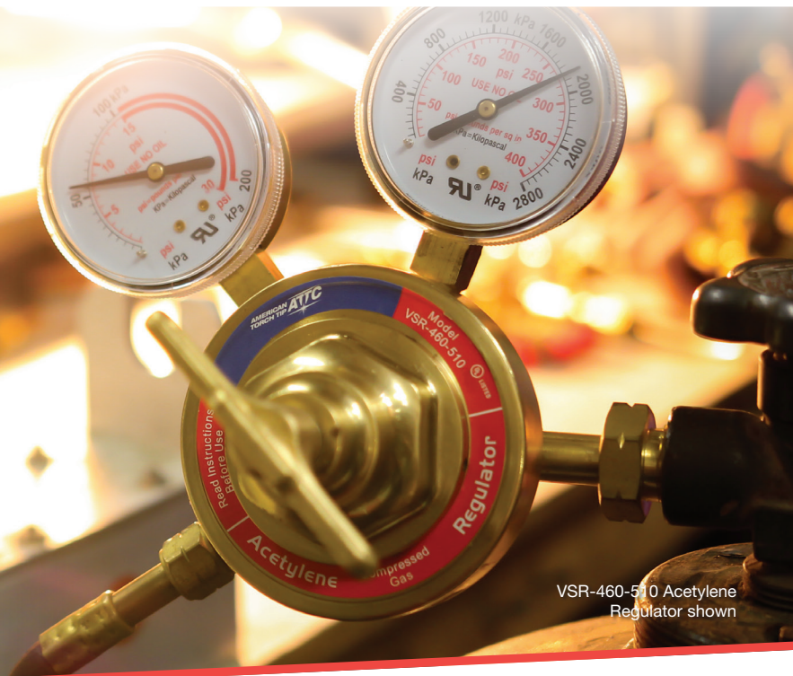
VSR-460-510 Acetylene Regulator shown