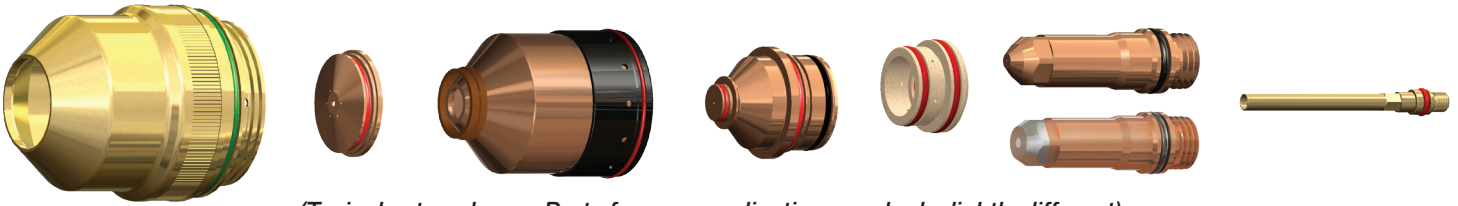
(Typical setup shown. Parts for your application may look slightly different)