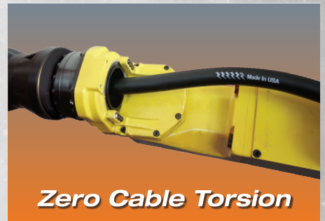
Zero Cable Torsion