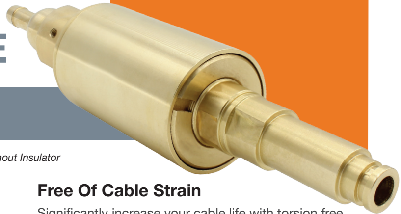
Product Shown Without Insulator